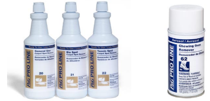
P&G Pro Line Carpet Spot Removers- General Use, Bio Spot, & Tannin Spot